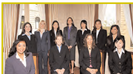
2008 Scholarship Recipients

Recipients are asked to attend a luncheon in their honor in June of the current year and The Financial Woman of the Year luncheon in September of the same year.